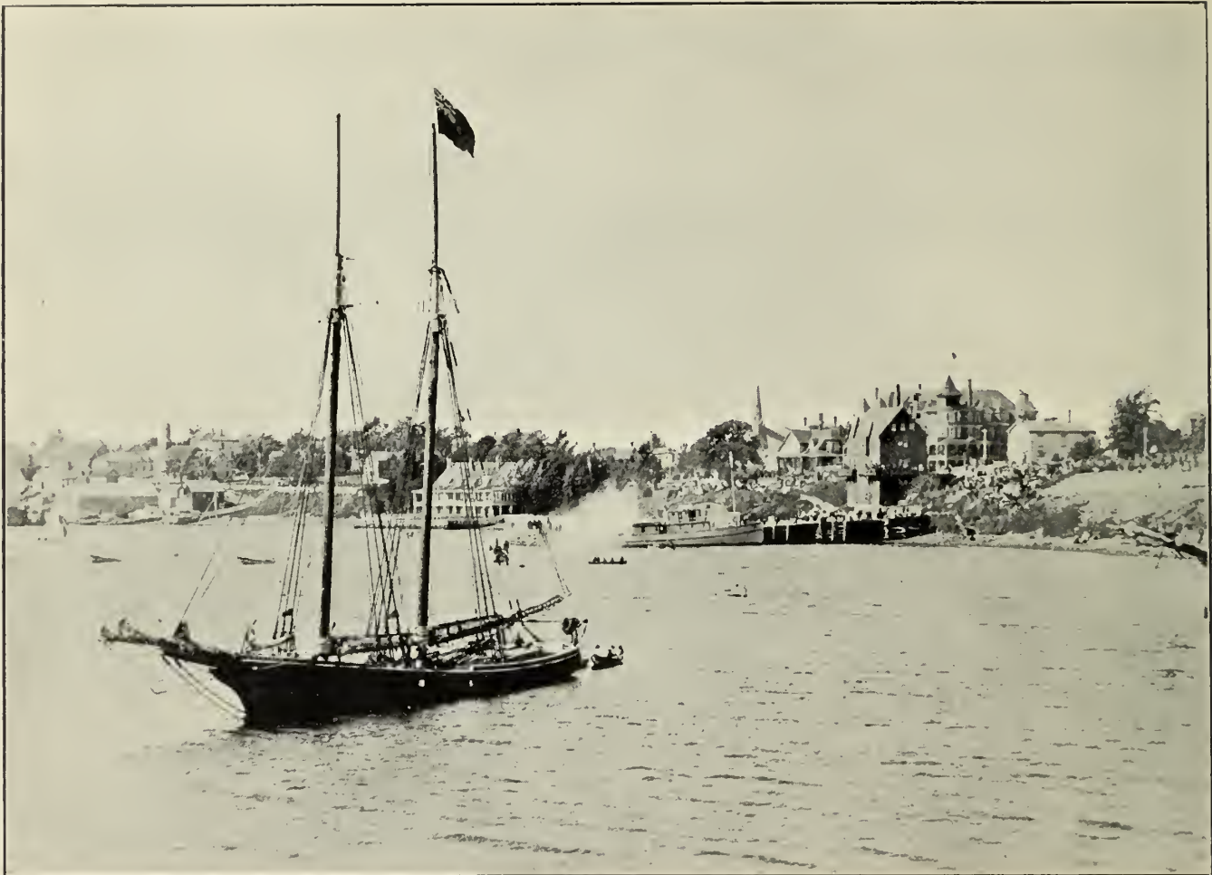
SYDNEY HARBOR, CAPE BRETON.